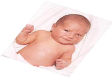
Figure 1: The lady with POI is naturally conceived with TCM preparation.

TCM Syndrome Pattern differentiation: Kidney Yang deficiency with Qi stagnation and blood stasis, Treating principle: Strengthen Qi and warm Yang, to remove Qi stagnation and blood stasis. Treatment detail: Acupuncture: Moxibustion at Ren8 (Shenque).